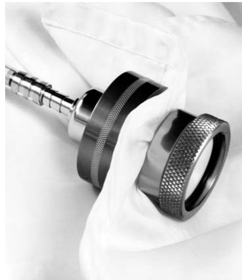
FIG. 2 Adapter